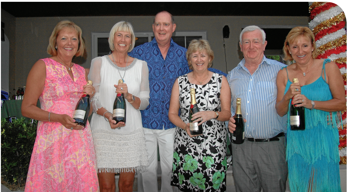
The Shoot Out best dressed winners

It only remains for me to wish you all a good start to the golfing season in the Algarve. I look forward to seeing you all at the various competitions and events over the next few months.