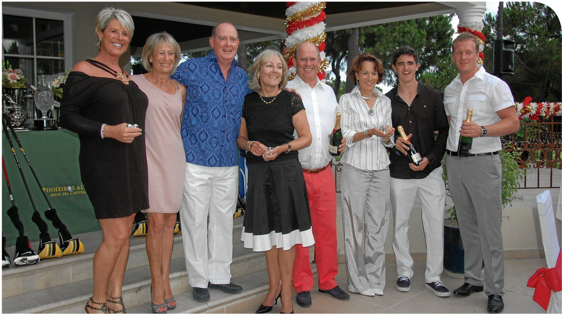
Nearest the Pin winners