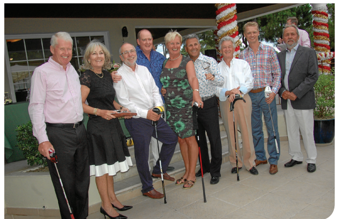
American Foursomes prize winners