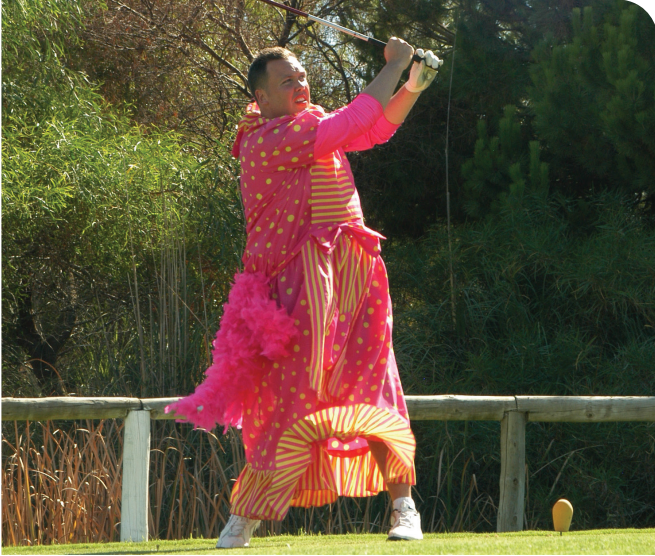
Anastasia Tremaine swing