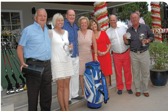
Greensome prize winners